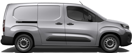
PARTNER Long (L2)