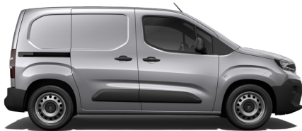
PARTNER Short (L1)